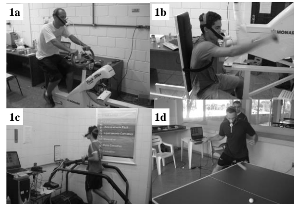
Fig 1. The figure shows the exercises performed in cycle ergometry (1a), arm crank ergometry (1b), treadmill (1c), which were considered as conventional ergometers, and the exercise in table tennis-specific procedure (1d).

also taken at 3, 5 and 7 minutes after the test. During all GTXs the oxygen uptake ( \text{VO}_2 ) was measured every three breath cycles by a portable metabolic system (MedGraphics VO2000, Medical Graphics Corp., St. Paul, MN, USA). The gas analyzer was always calibrated before each test following manufacturers' recommendations. Heart rate (HR) values were continuously recorded with gas exchange (Polar, Kempele, Finland) and interconnected with portable metabolic system. In all GTXs, gas exchanges and HR samples were averaged every 30 seconds, and the highest values reached were regarded as peak values. Rating of perceived exertion (RPE) (Borg, 1982) was also measured after exercise stages. The anaerobic threshold was considered as the intensity of fixed lactate concentration corresponding to 3.5 \text{ mmol}\cdot\text{L}^{-1} (OBLA) (Morel and Zagatto 2008; Zagatto et al. 2008). Figure 2 shows an anaerobic threshold determination.